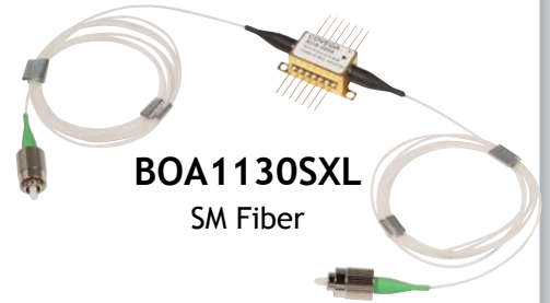
BOA1130SXL SM Fiber