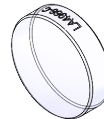
ISOMETRIC VIEW SCALE: 5:1