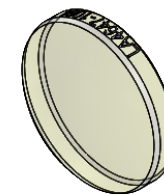
ISOMETRIC VIEW SCALE: 2:1