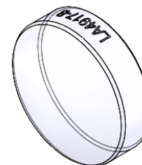
ISOMETRIC VIEW SCALE: 5:1