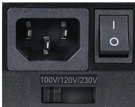
Voltage Selector Switch