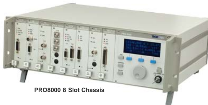
PRO8000 8 Slot Chassis

Easy-to-Read Display For Operation, No PC is Required