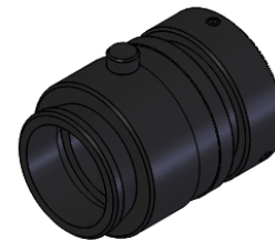
1:2 ISOMETRIC VIEW FOR REFERENCE ONLY