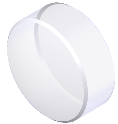
25:1 ISOMETRIC VIEW FOR REFERENCE ONLY