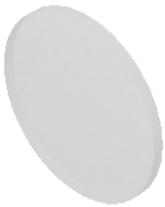
1:2 ISOMETRIC VIEW FOR REFERENCE ONLY